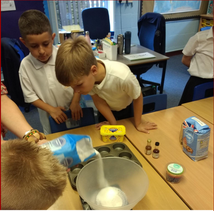
Autumnal fruit pies baked by our very own Amethyst Class, including produce found on the school grounds such as blackberries and apples.