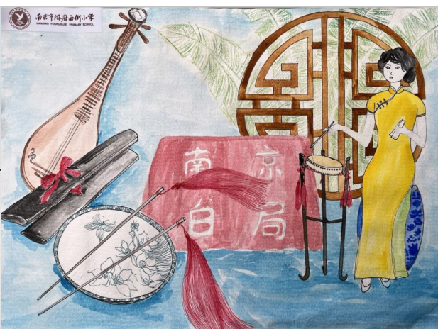
Artwork by Pupils in China.