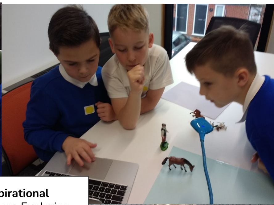
Being Aspirational Moonstone Class Exploring Possible Creative Careers