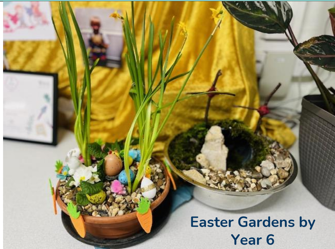
Easter Gardens by Year 6

As part of our celebrations for World Book Day, we also ran a competition where children were asked to create a character from a book on a wooden spoon. The entries have been wonderful and a lot of effort has clearly gone into them. The whole school can see these superb creations every day in our school when they walk past them on their way to assembly and we often hear many positive comments about them, along with people stopping by to admire them and see if they can guess who the character is. It has been a fantastic way to generate book talk and discussions around books and reading as it really is one of the most important things a child can learn - reading for pleasure!