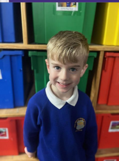
Kindness Cup Winner