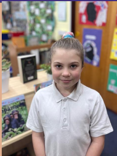
Manners Medal Winner

WORSHIP THEME: Hard Work and Resilience Galatians 6:9