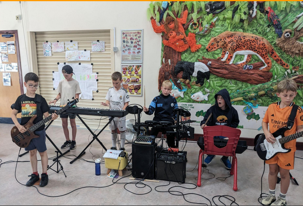
Rock Steady Star Performances

We are an inclusive, aspirational school that builds a kind and resilient community.