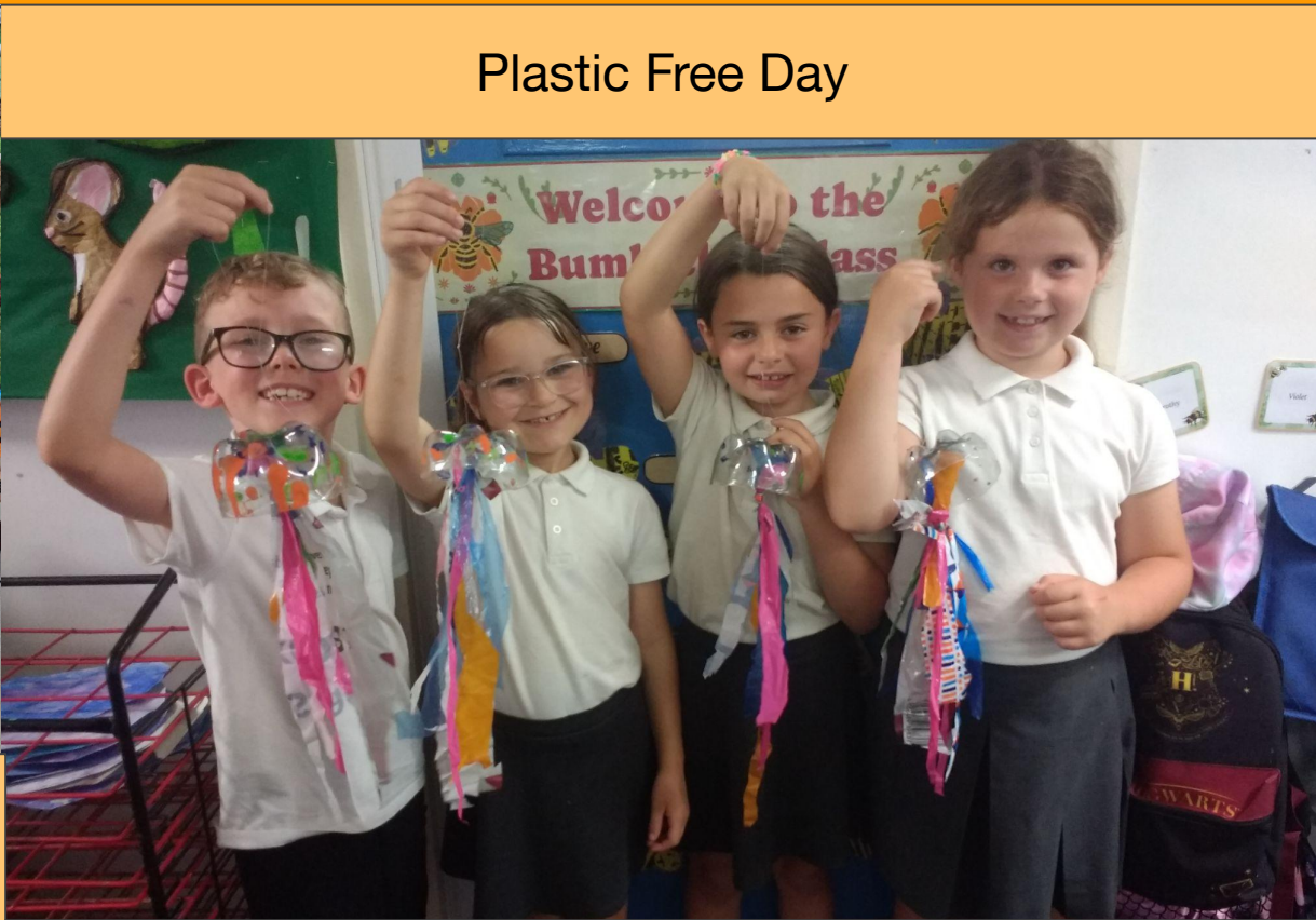
Plastic Free Day