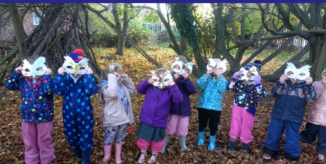
EYFS at their first Muddy Monday sessions in our forest school area.