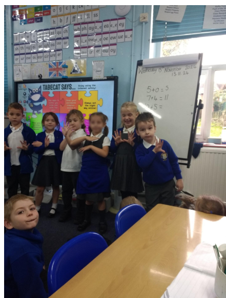
Pangolin Class have made some human number sentences for addition. It was great to see them using each other work to out the answers.