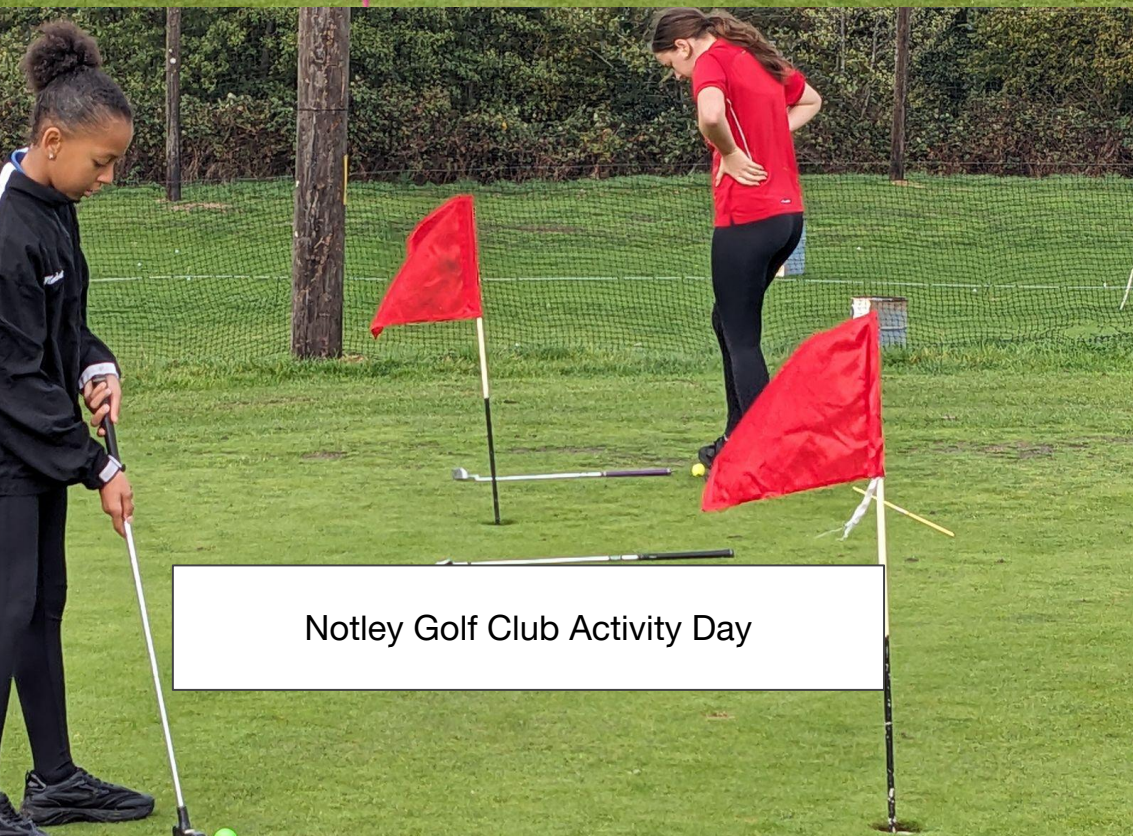
Notley Golf Club Activity Day